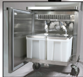
Refrigerated Cab showing slide-out mix shelf & bag connection system