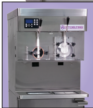
Model U444 (without mixer)