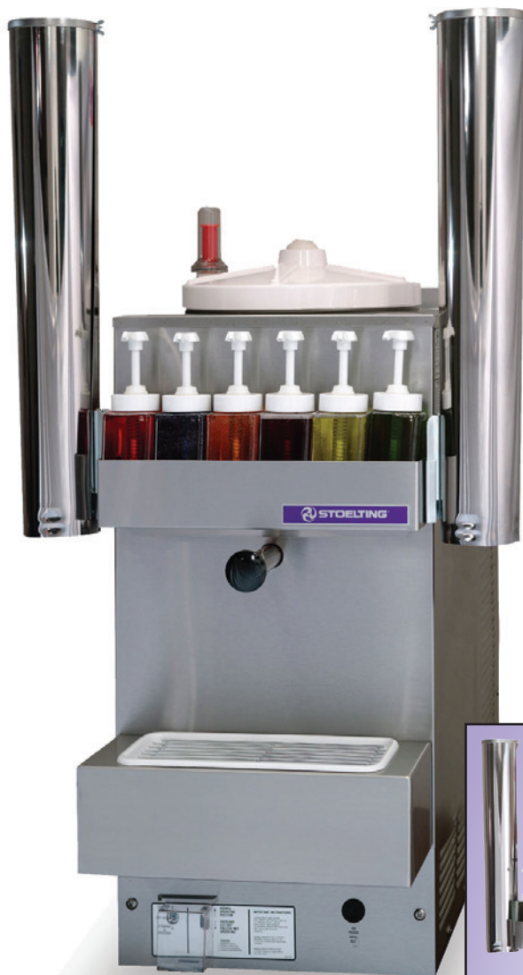
E157 Counter Model