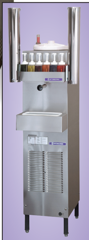
E257 Floor Model